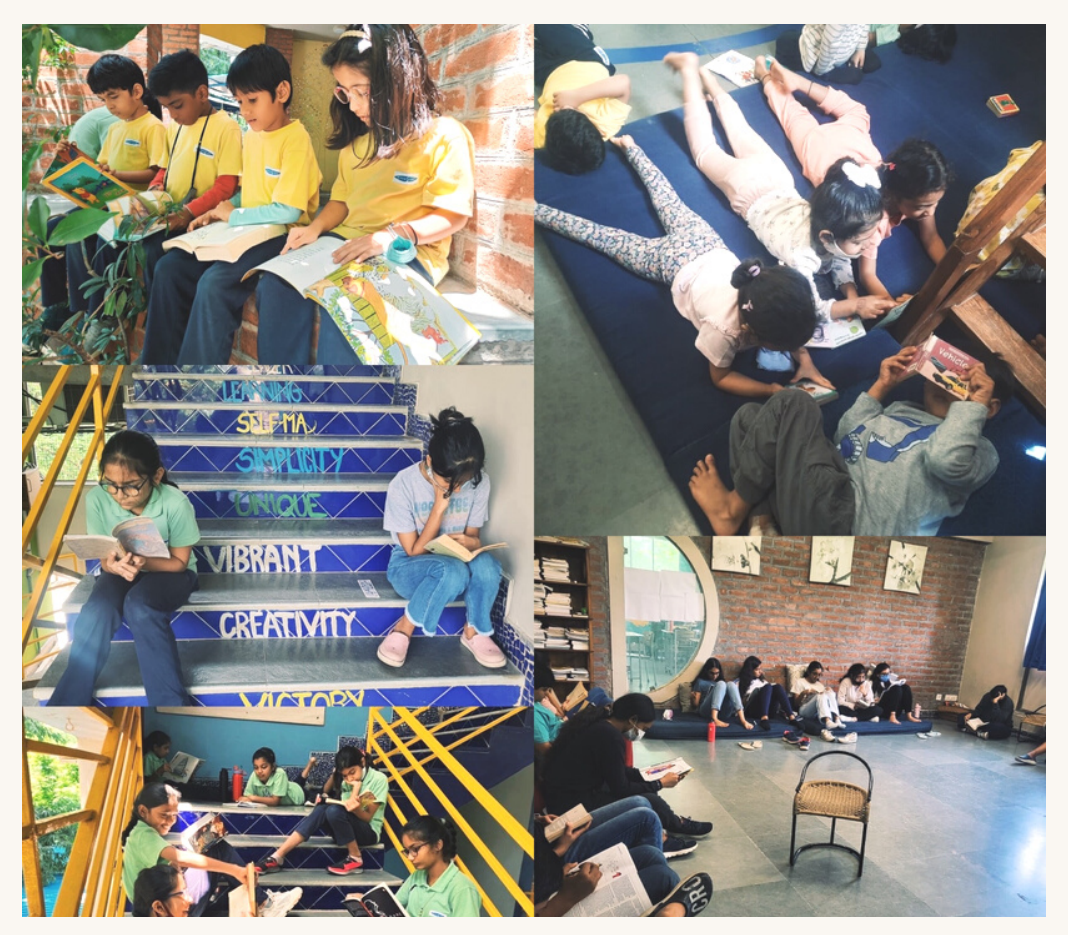
Silence enveloped the countryards of The Riverside School